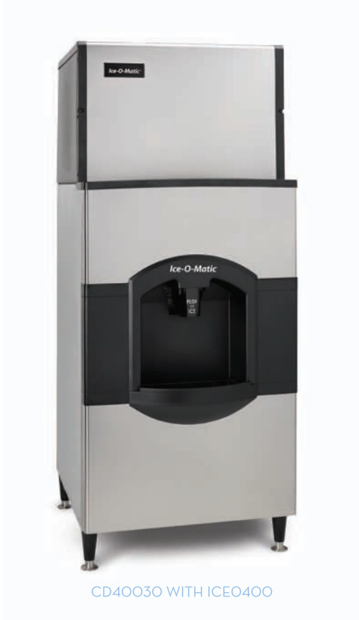
CD40030 WITH ICEO400